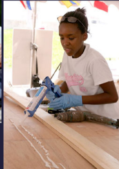
Youth job training