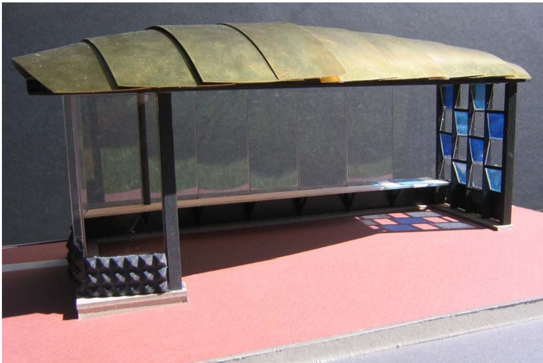
Model of the Bus Shelter at Monument Square

This project generated significant contributions and in-kind support from sources outside of the City. Verizon donated telephone equipment and installation. METRO provided a variety of resources, including the purchase of lighting and heaters. It is also important to recognize the efforts of the City’s Public Works Department in ongoing project review and in-kind support.