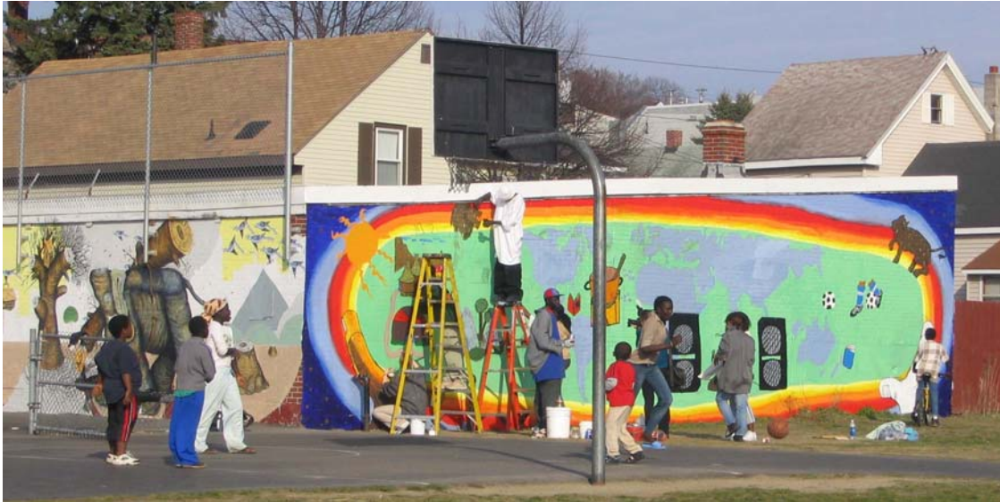
Mural to the left by Andrew Schoultz. Mural to the right by Bayside Neighborhood youth

The Public Art Committee identified the maintenance building at the Bayside Park on Fox Street as an appropriate location for the mural. Bayside Park, slated for a phased redevelopment with CDGB grants, is scheduled to develop a playground adjacent to the maintenance building.