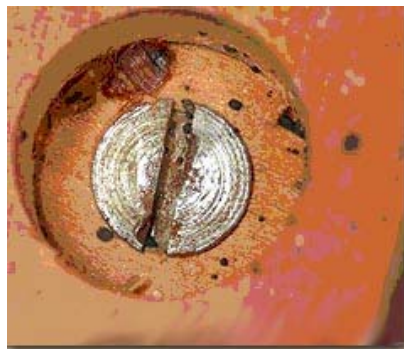
Bed bug in wooden furniture (above the head of the screw)