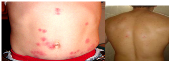
Bed bug bite marks to the back and abdomen