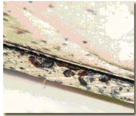
Bed bugs in a mattress seam